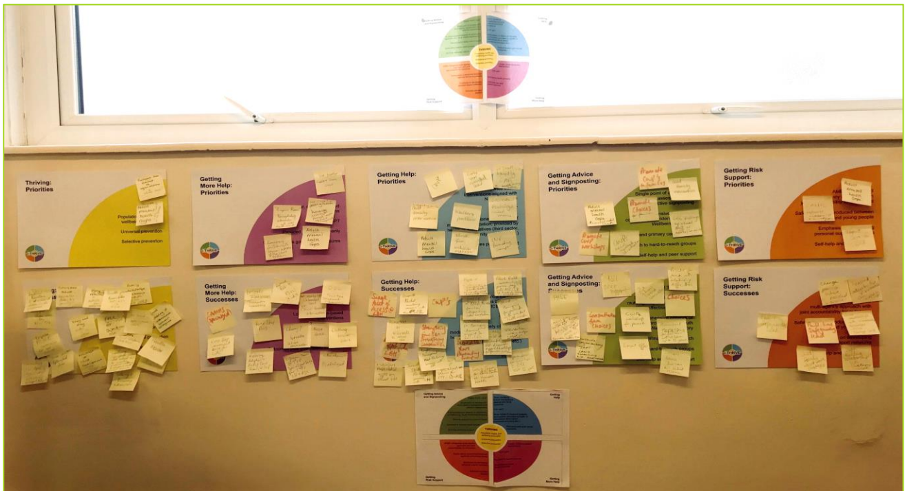
Figure 1. Output from THRIVE needs based grouping mapping exercise.

The output from the day was synthesised by the i-THRIVE Programme and shared with Seven Sisters Primary School to facilitate further discussions and to support the implementation of the THRIVE Framework.